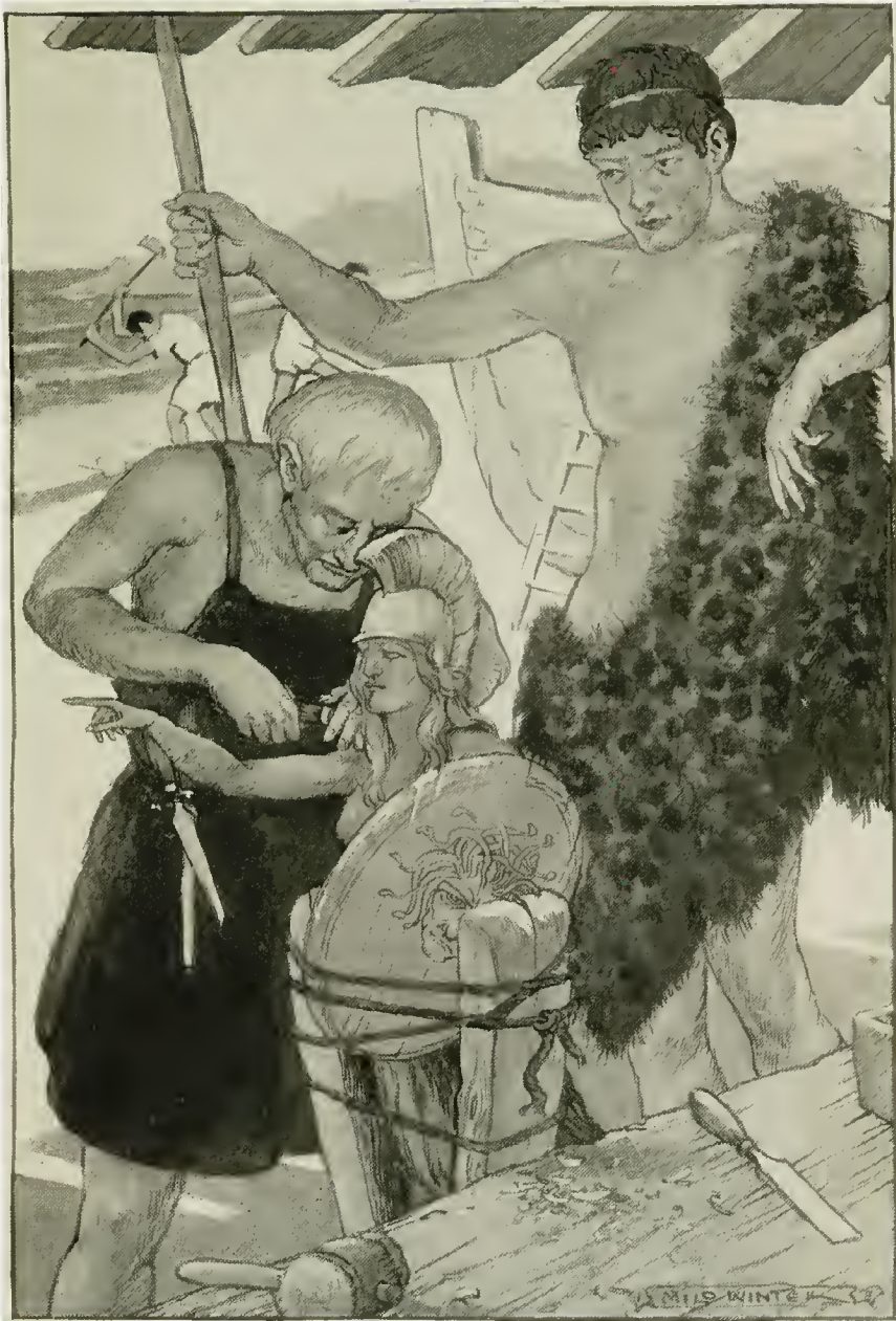
Jason was delighted with the oaken image, and gave the carver no rest until it was completed